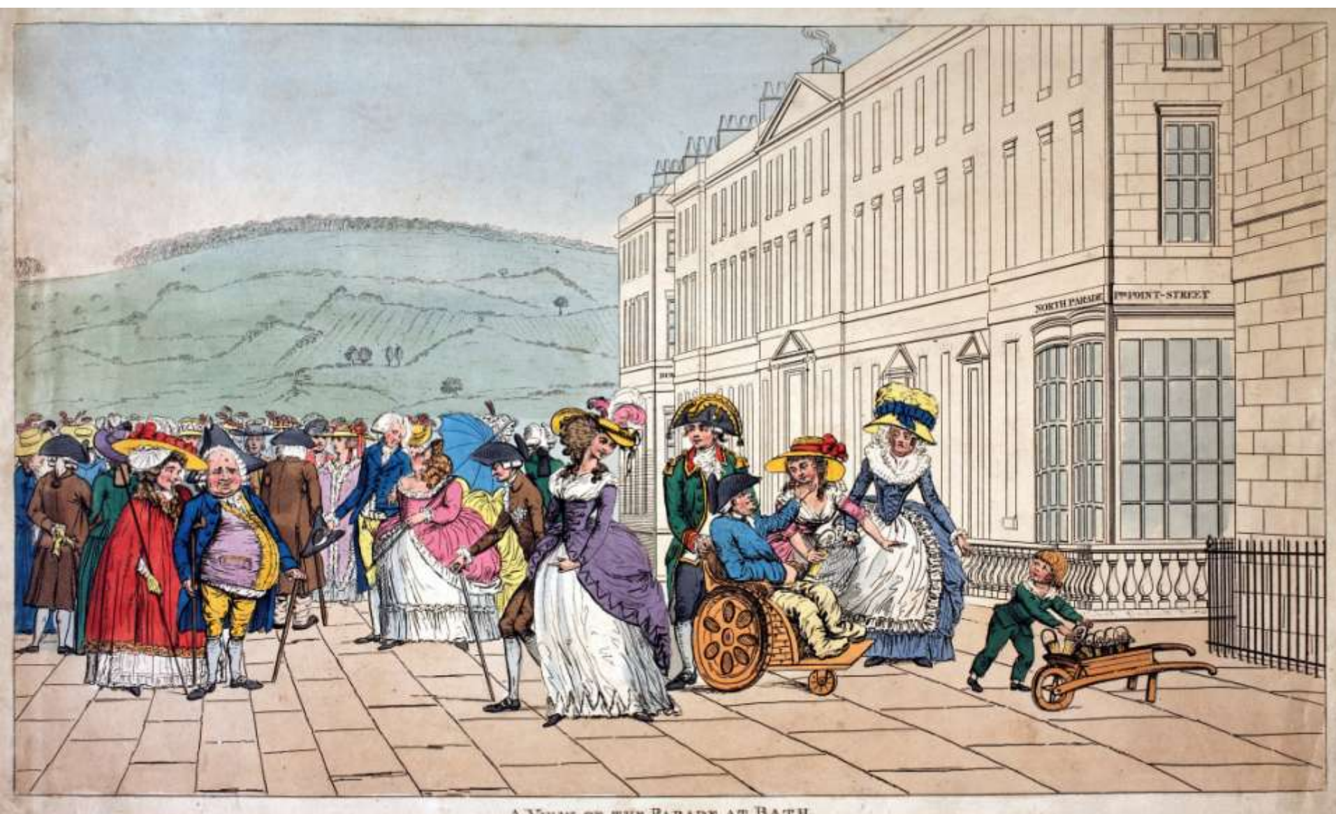
A VIEW OF THE PARADE AT BATH.