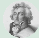
Charles de Ligne