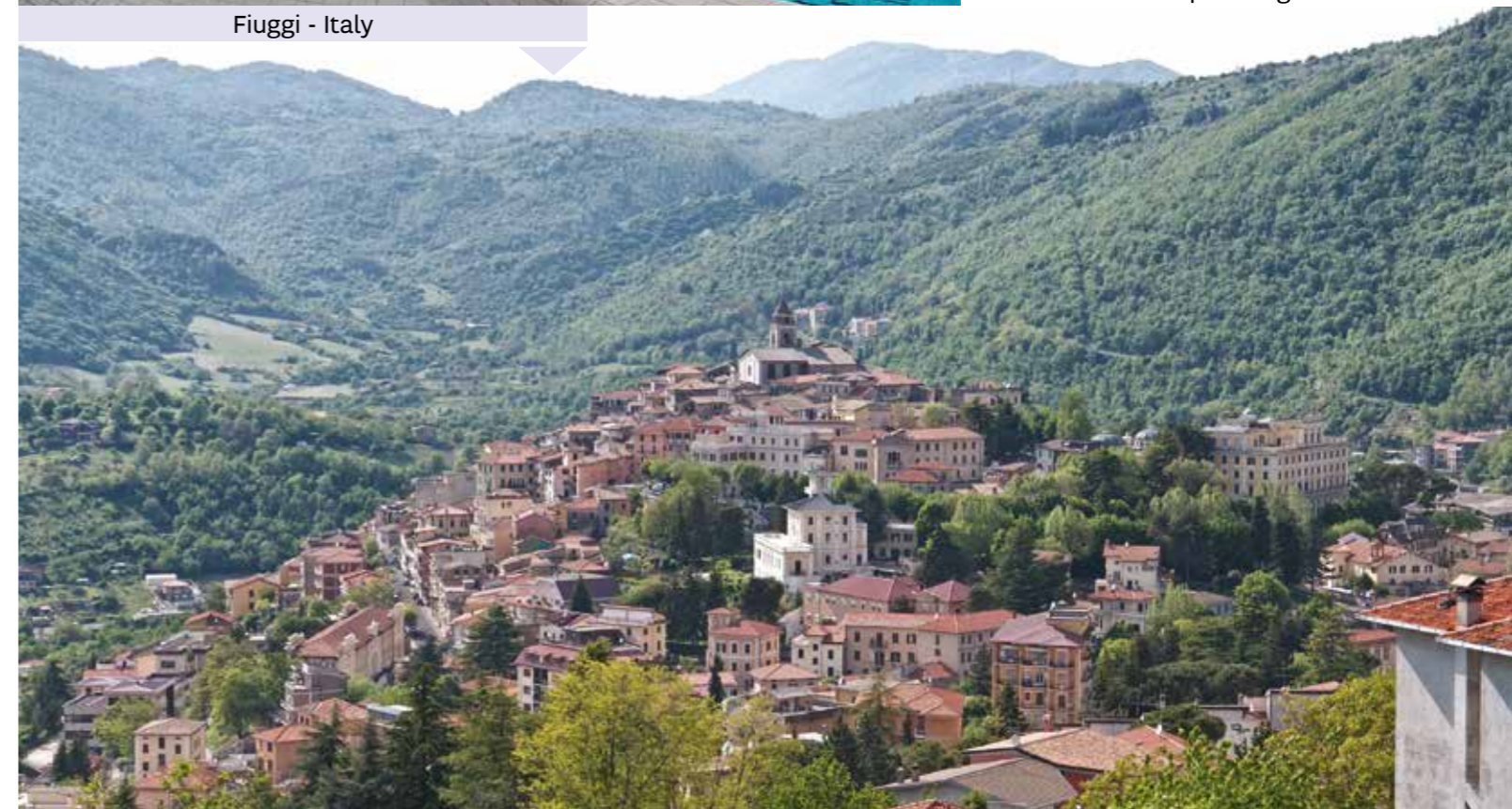
Fiuggi - Italy