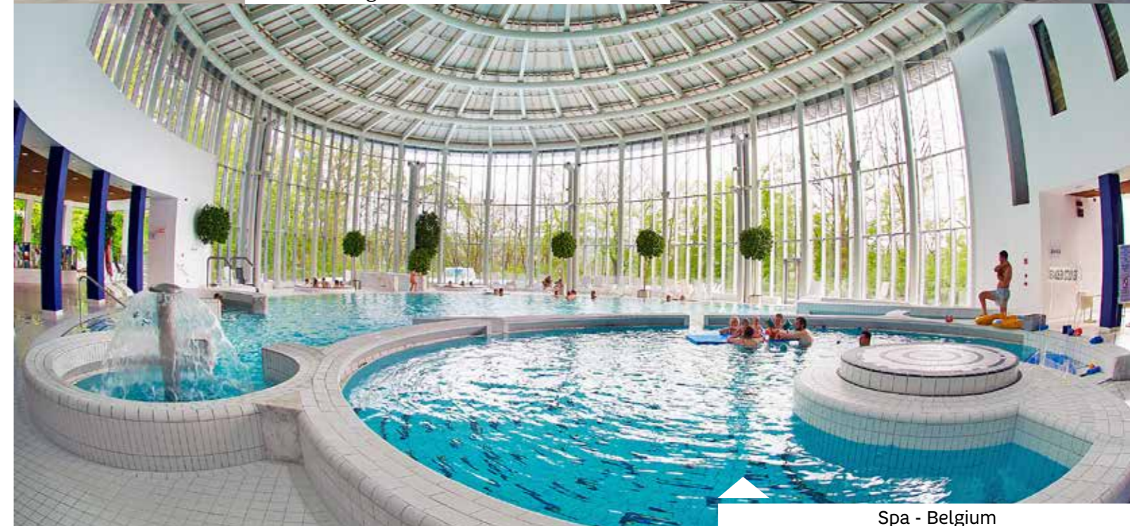
Spa - Belgium