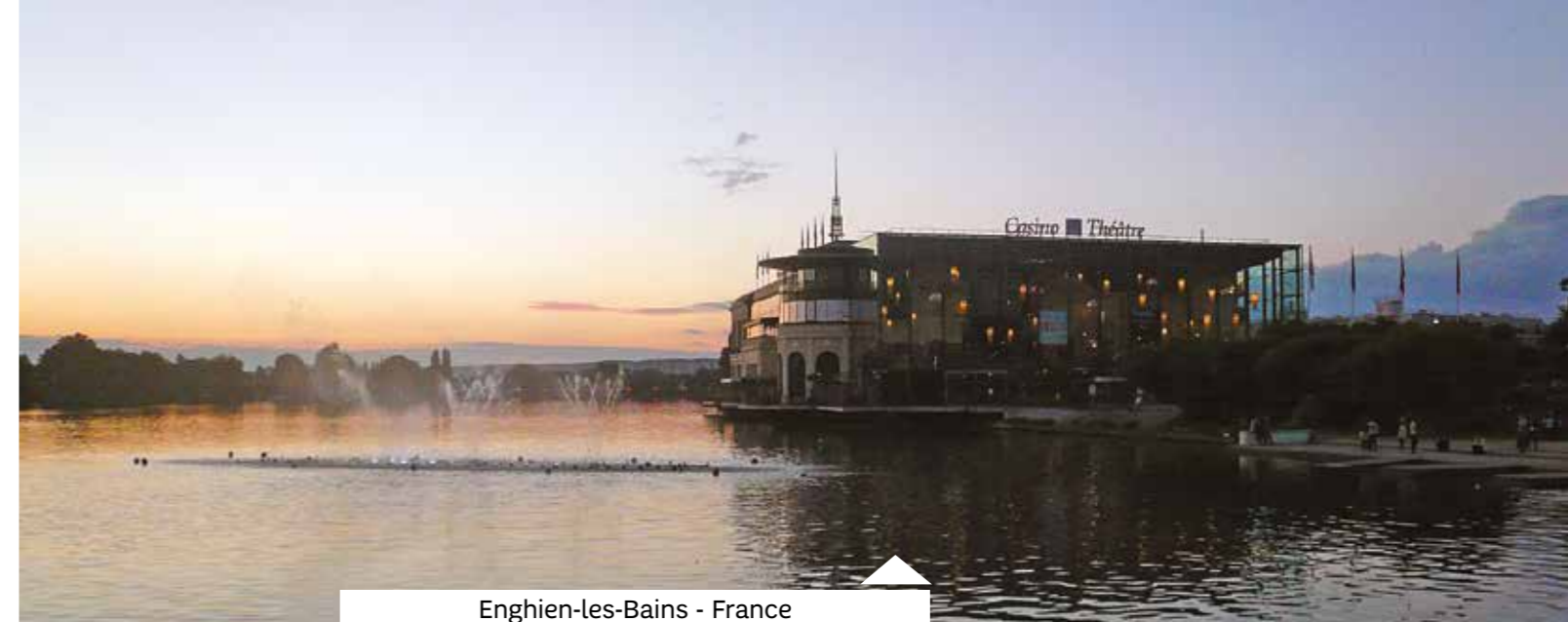
Enghien-les-Bains - France

Collectively, the member towns of EHTTA are an integral part of the Cultural Route of Historic Thermal Towns, one of the 26 cultural routes recognised by the Council of Europe (under the same title as the cultural route known as the Santiago de Compostela Pilgrim Routes).