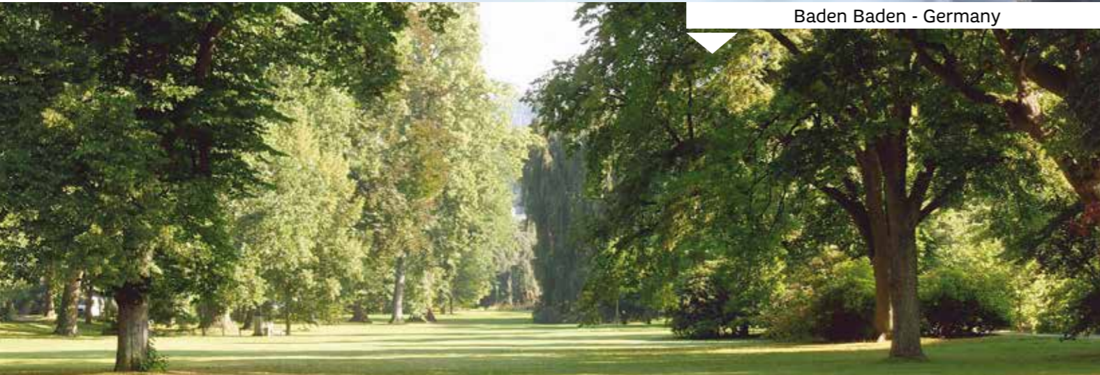
Baden Baden - Germany