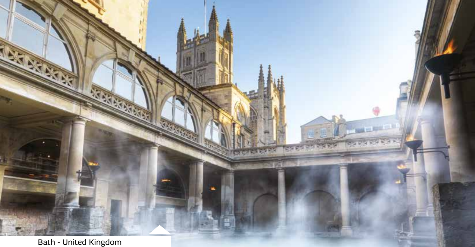
Bath - United Kingdom